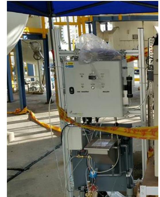
Photo showing the MS1200 in the petrochemical plant.