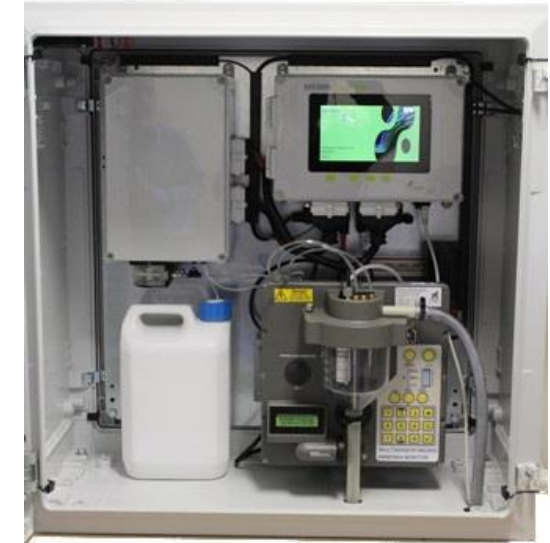
Photo showing the MS3500, Ammonia Monitor for Raw Wastewater

Learn more on the new ammonia analyser by clicking on the image