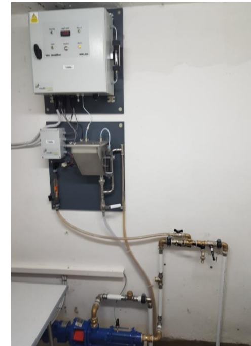
A picture of the unit installed in the outbuilding.